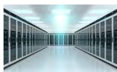
Large-scale server room