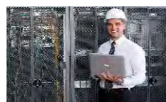
Traditional Server Room