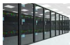
High heat density data center